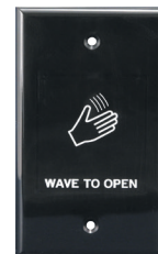
CL2025 Touchless Plate