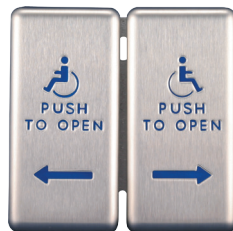
CL2388 Dual Vestibule Push Plate