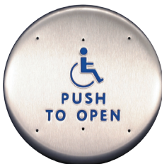
CL2216 Round Plate